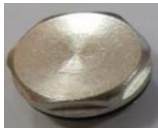
End Plug x1