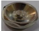
Air Vent x1