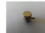
AIR VENT 1PCS