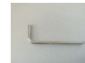
ALLEN KEY 1PCS