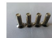
SMALL SCREW 4PCS