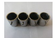
WALL BUCKET 4PCS